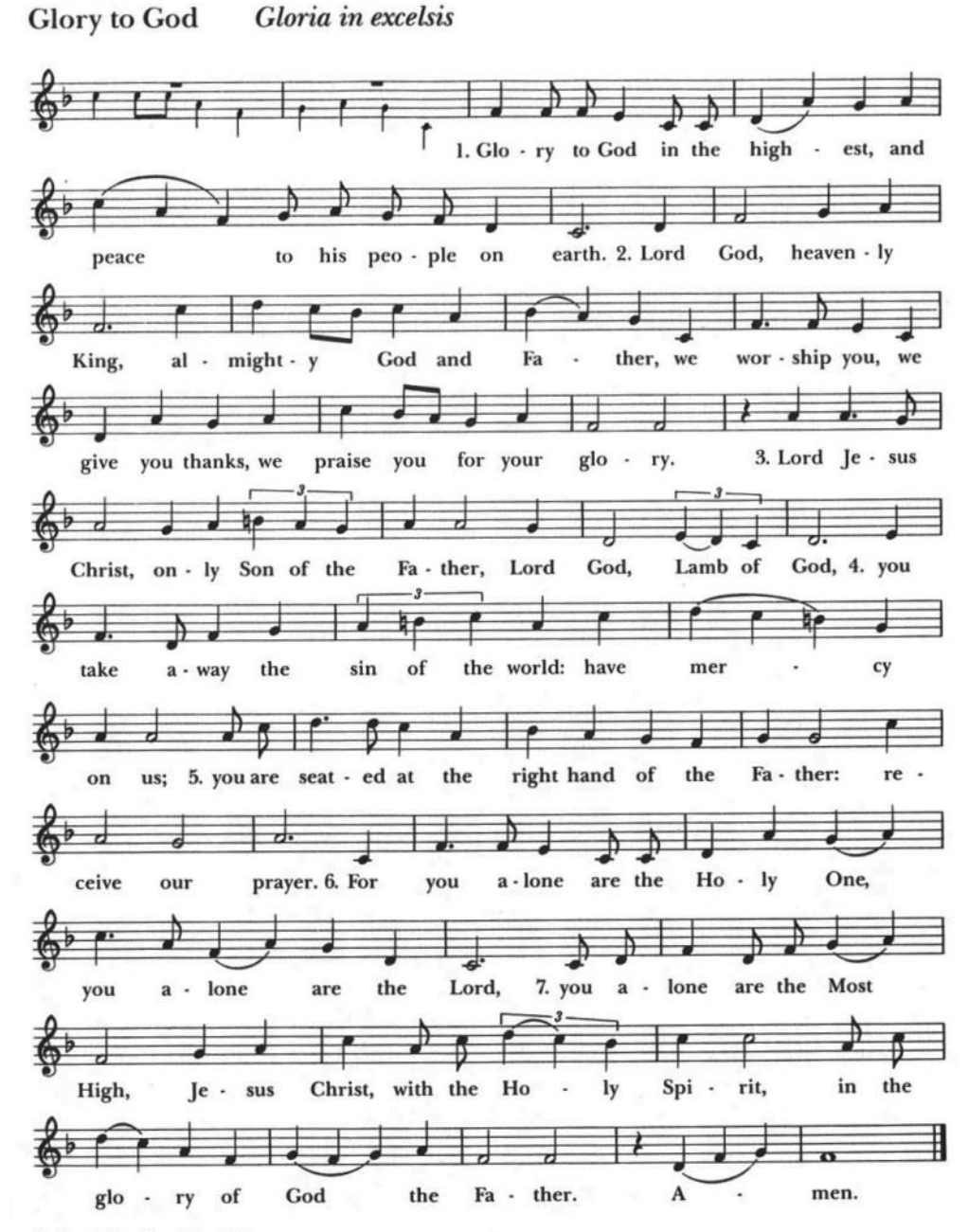
S 280 Canticle 20