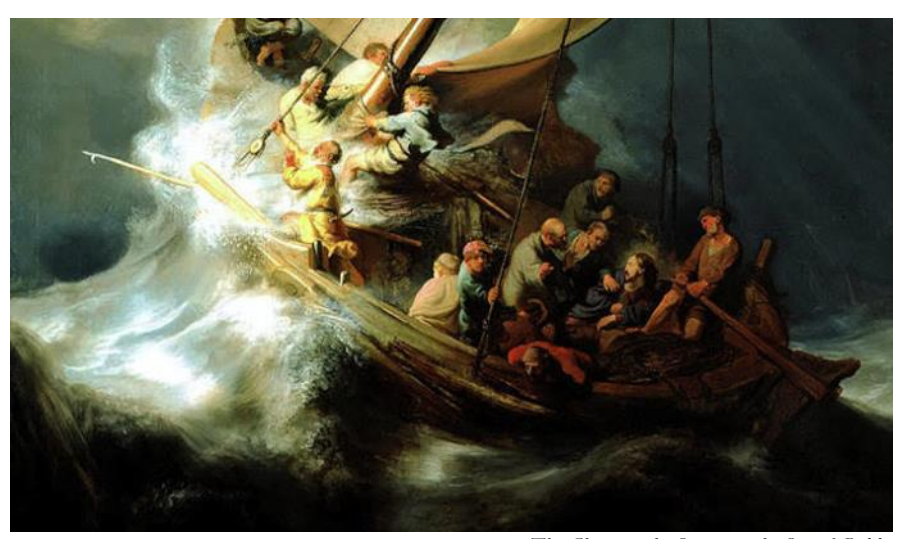
The Christ in the Storm on the Sea of Galilee Rembrandt 1633